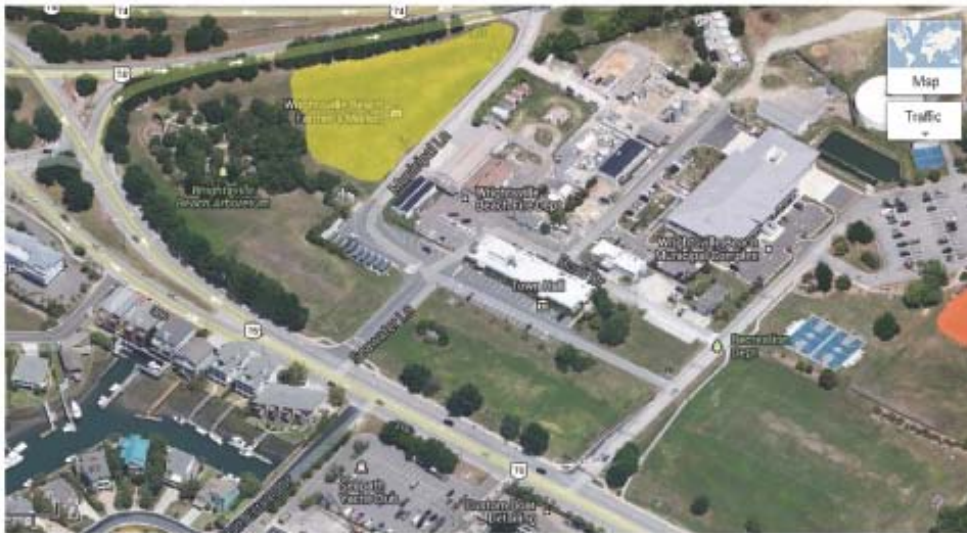
AERIAL VIEW OF PARKING AREA